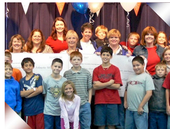
Alkek Elementary students and staff are all smiles after receiving over $5,300 in educator initiative grants from the Foundation.

Bandera Independent School District EDUCATION FOUNDATION