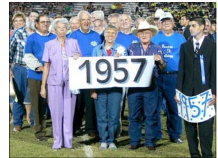
The Class of '57 enjoy Homecoming Game Festivities thanks to the Education Foundation.