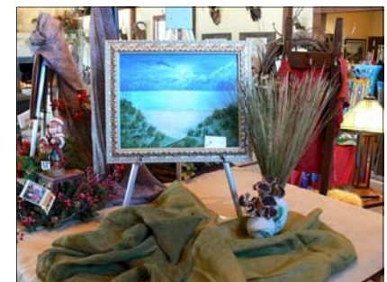
The Baubles and Boots Celebration raises money through great auction items and donations.